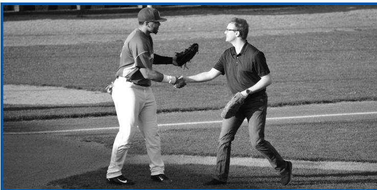
Throwing out the first pitch at the Old Orchard Beach Surge game.