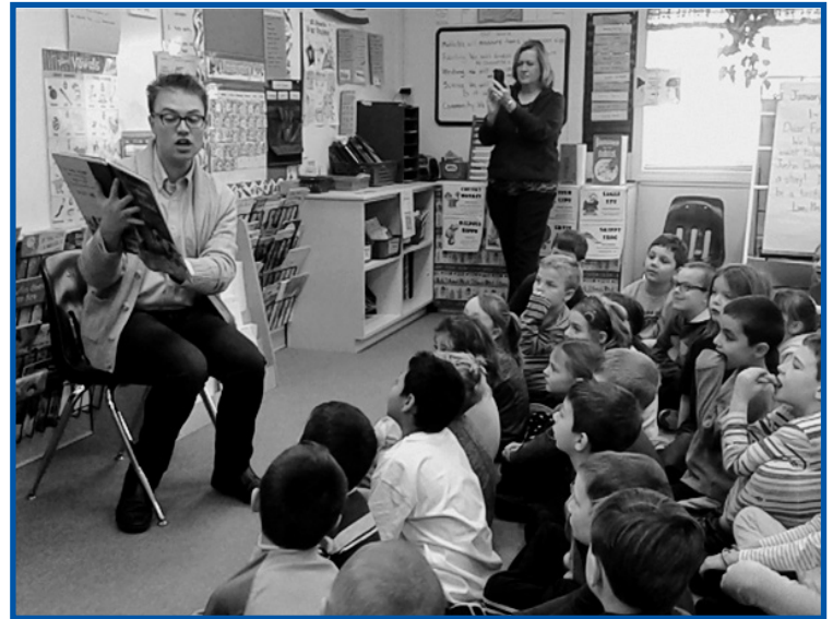
Reading to 1st graders at Young School in Saco.

A new law will cover the cost of mental health care for service members, help cut dangerous wait times for those in crisis and gather data about the number of veterans who need care. This law goes a long way toward preventing those veterans, who gave so much, from falling through the cracks.